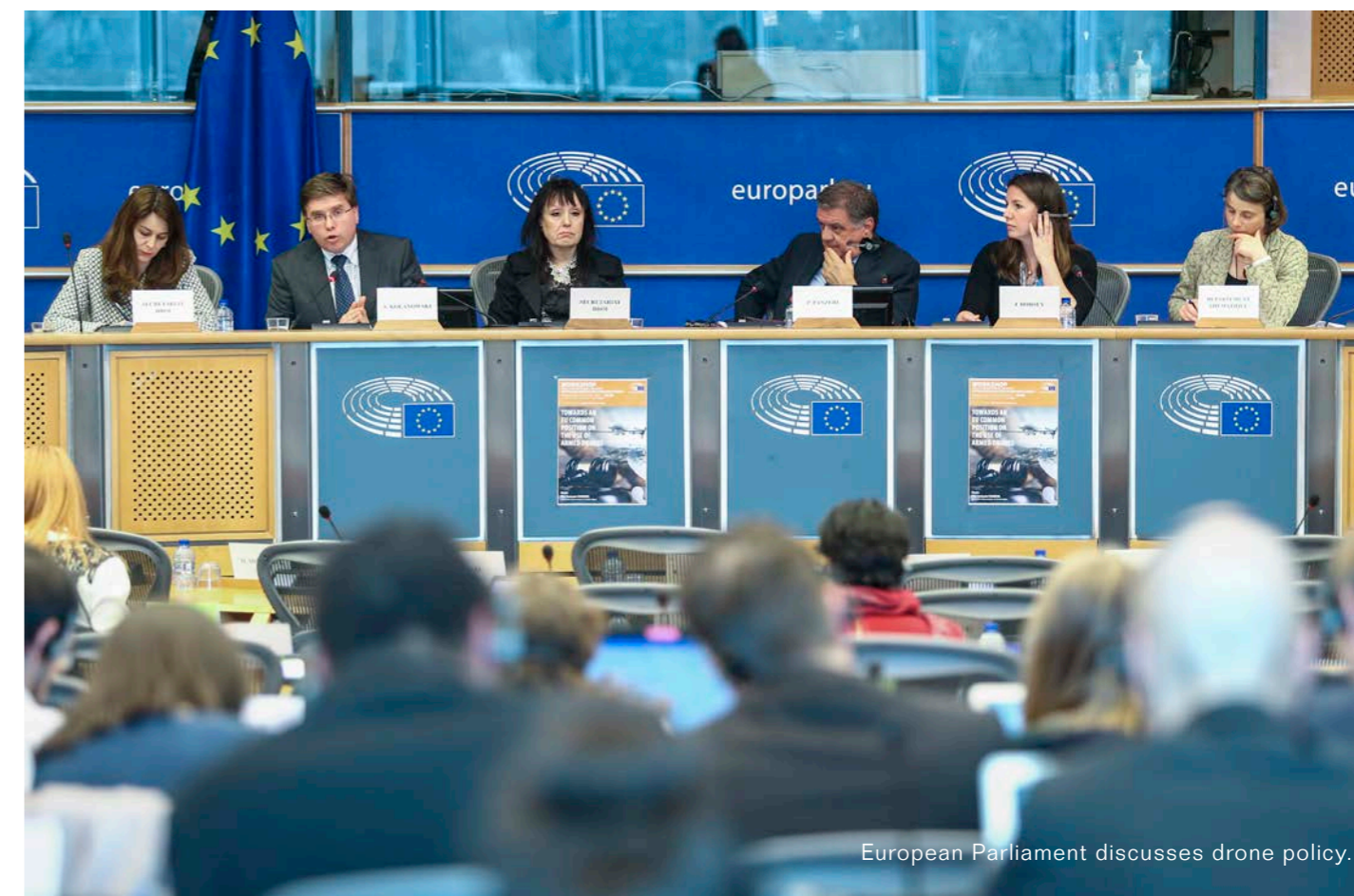
European Parliament discusses drone policy.