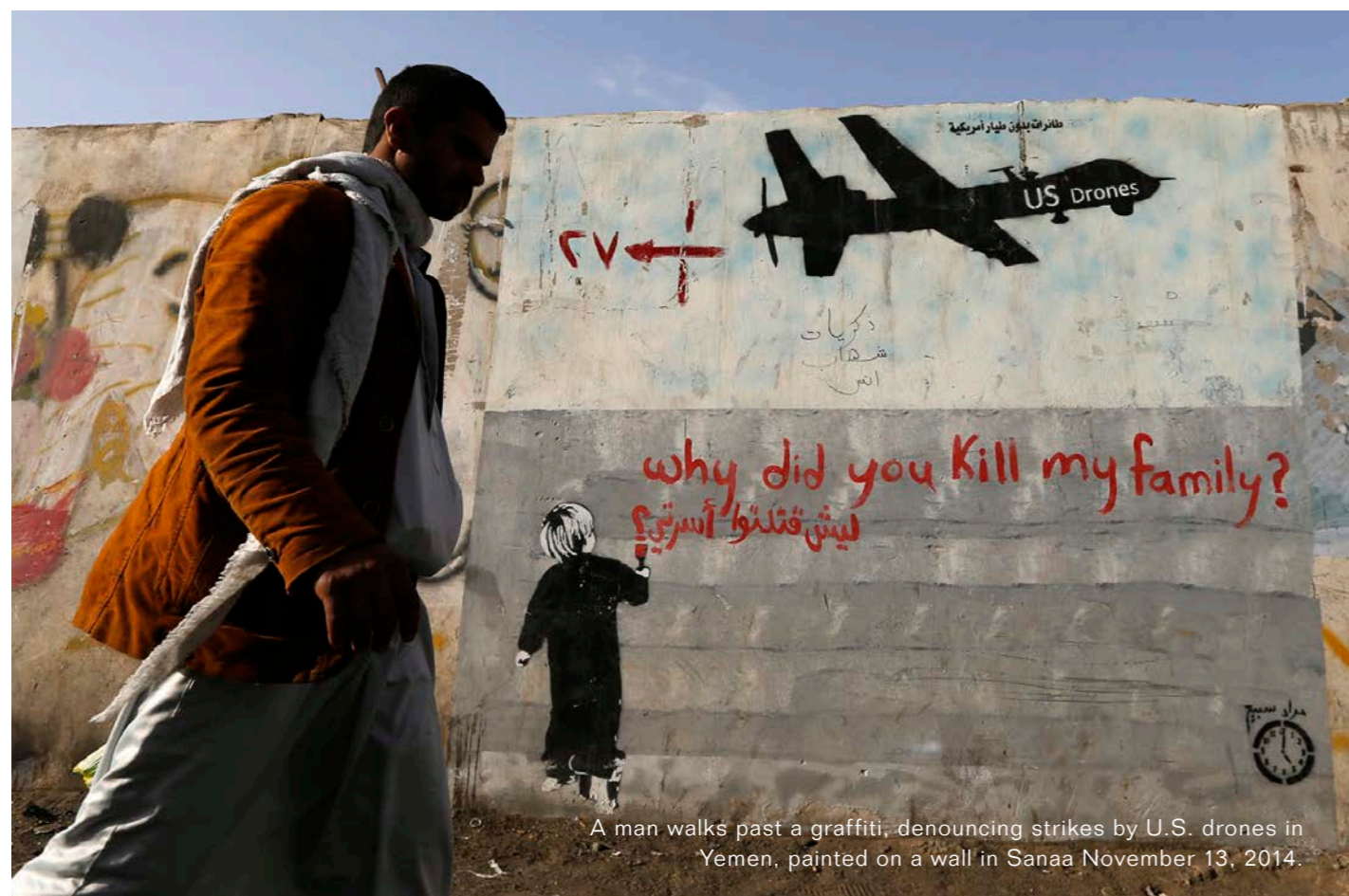
A man walks past a graffiti, denouncing strikes by U.S. drones in Yemen, painted on a wall in Sanaa November 13, 2014.