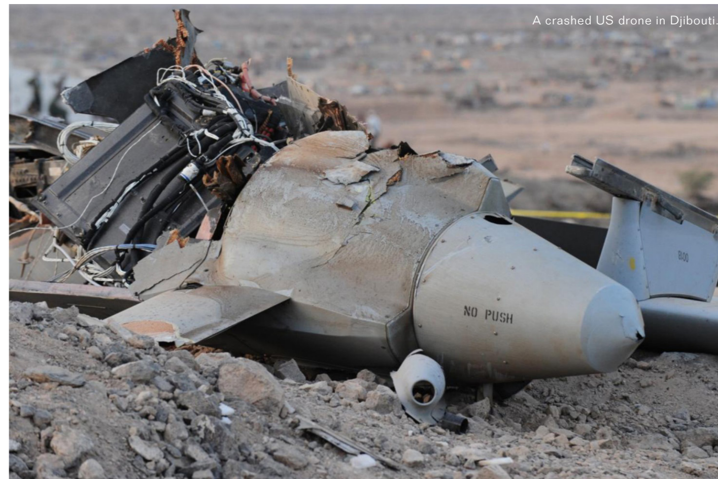
A crashed US drone in Djibouti.